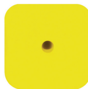
LITTER MAX 2