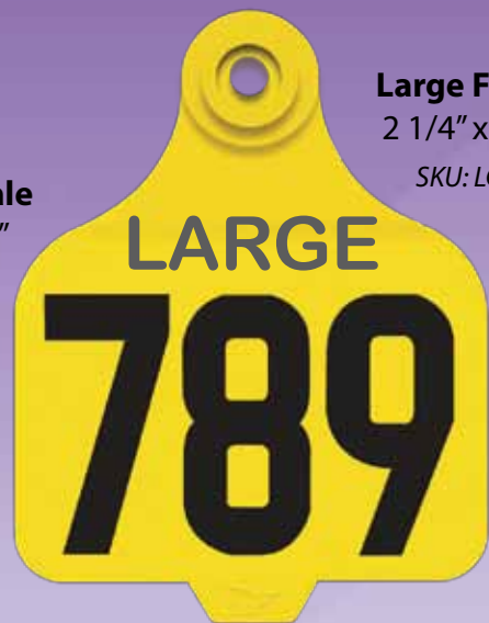
Large Female 2 1/4" x 2 3/4" SKU: LGSET