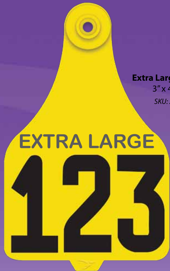
Extra Large Female 3" x 4 5/8" SKU: XLSET