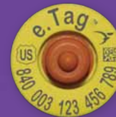
HD.Tag™ - FDX Technology 1.2" Diameter SKU: ANESET Tag weight: 9.18 grams