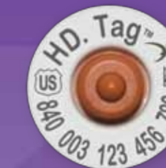
HD.tag™ - HDX Technology 1.2" Diameter SKU: ANHDSET Tag weight: 8.0 grams