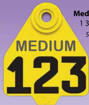
Medium Female 1 3/4" x 1 7/8" SKU: MDSET