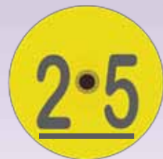
Standard Round 1 1/8" Diameter SKU: RHGSET