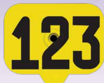
Hog Max 2 1/8" x 1 1/2" SKU: HMSET