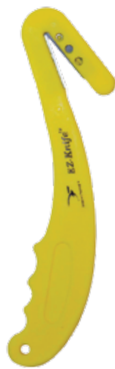
E-Z Knife™ SKU: AC7004