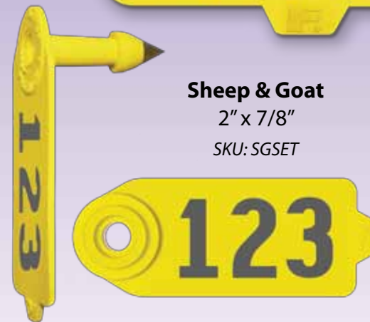
Sheep & Goat 2" x 7/8" SKU: SGSET