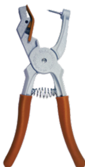
ProGripII™ Applicator SKU: AC7066