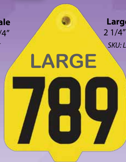
Large Male 2 1/4" x 2 3/4" SKU: LGSTPAN