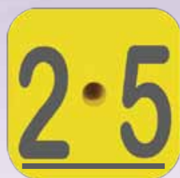
Litter Max 2 1 1/4" x 1 1/4" SKU: LM2SET